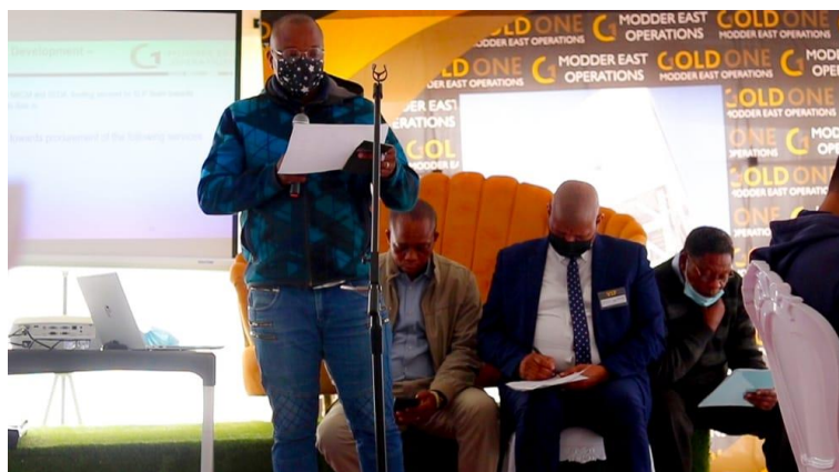
Picture 8 - Member of Vele Integrated Services (Pty) Ltd, Mr... delivering an appreciation note to NKGM