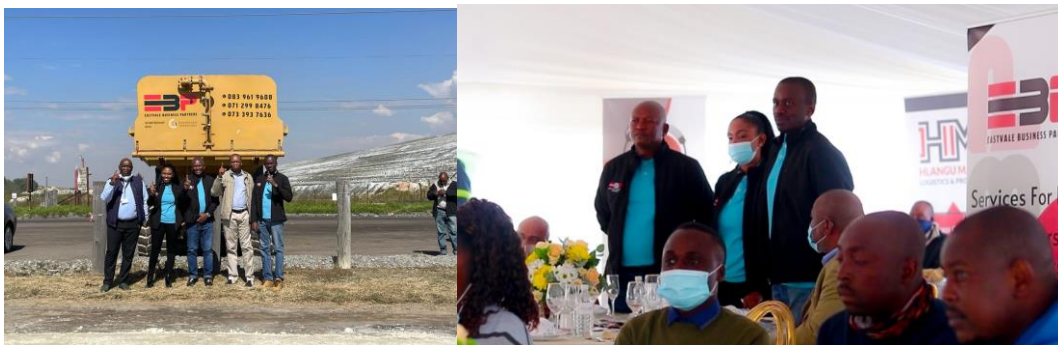
Picture 6 - Members of Eastvale Business Partners and the truck advanced to the enterprise by NKG M