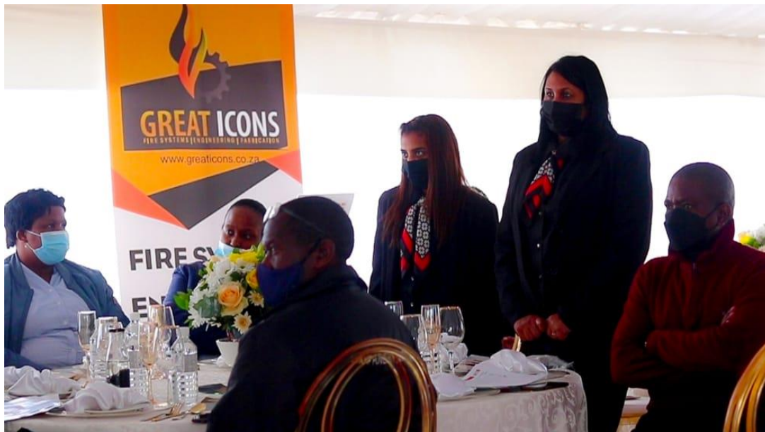
Picture 10 - Members of Pocket Power CC being introduced to the dignitaries

SEDA has facilitated the development of Pocket Power’s bankable business plan and the same business plan has been submitted to NEF for equipment procurement and business premises procurement.