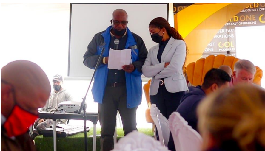
Picture 9 - Member of Hlangu Mash Trading and Projects delivering an appreciation note to NKGM management